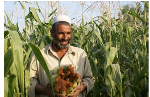
Maize in Afghanistan (Photo Idea-New)

Maize is the third most important cereal crop in Afghanistan (after wheat and barley). Grown throughout the country and in different ecological zones, maize is used for both human and animal consumption. Maize is cultivated extensively in Paktia and Nangarhar provinces. Production for 2012 is predicted at 310,000 ton from 141,000 ha at a relatively low average yield of 2.2 t/ha.