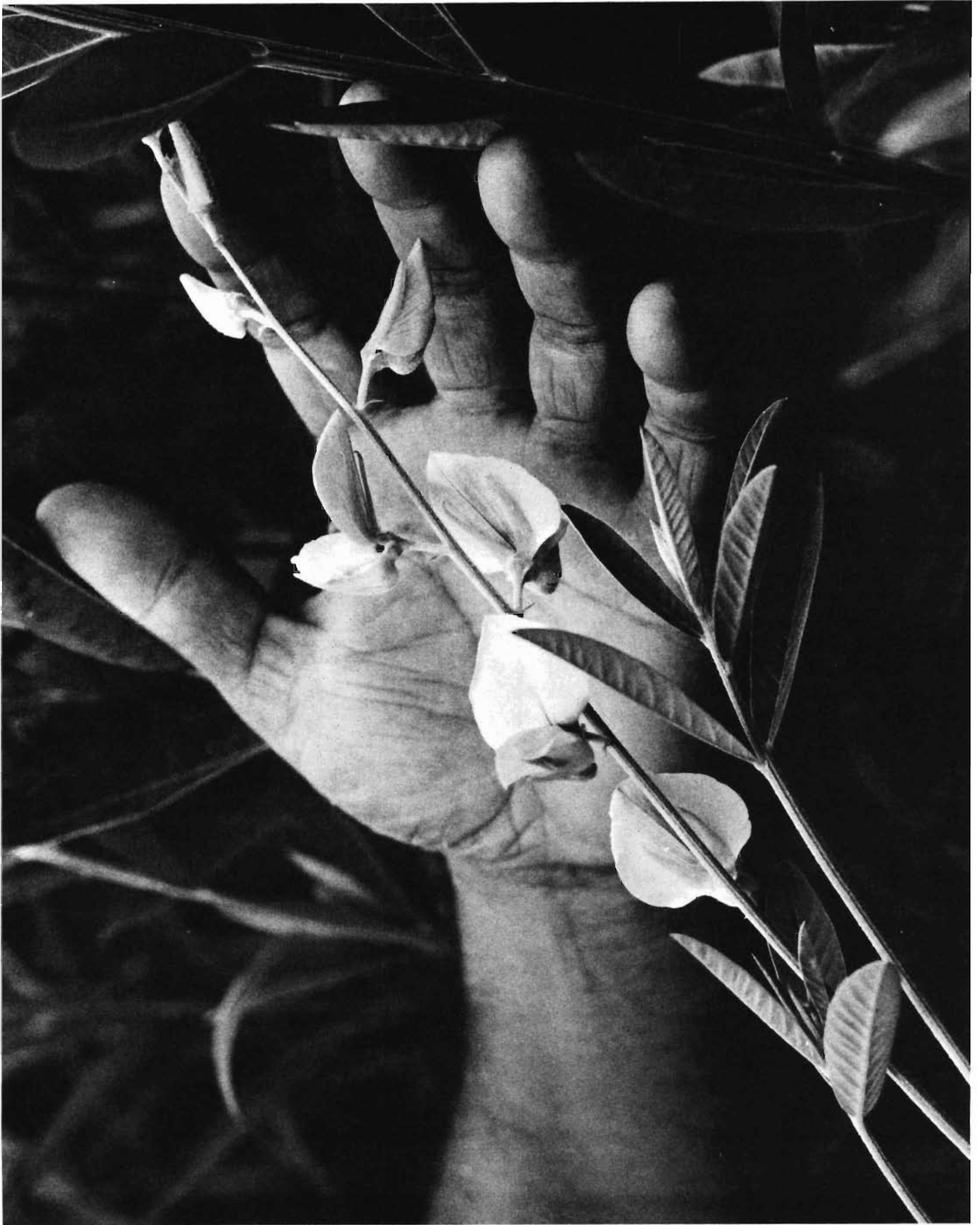
Figure 2. Flowers of 'Tropic Sun' sunn hemp.