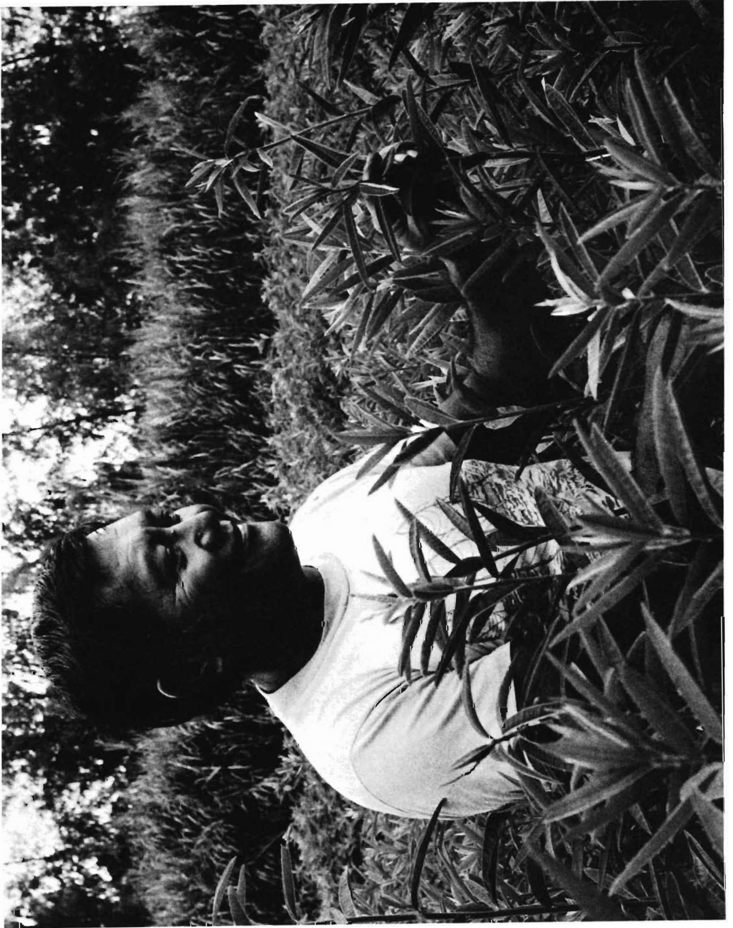
Figure 1. 'Tropic Sun' sunn hemp at 50 days of age.