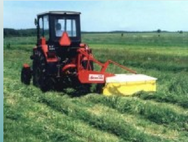
Examples of Drum Mowers