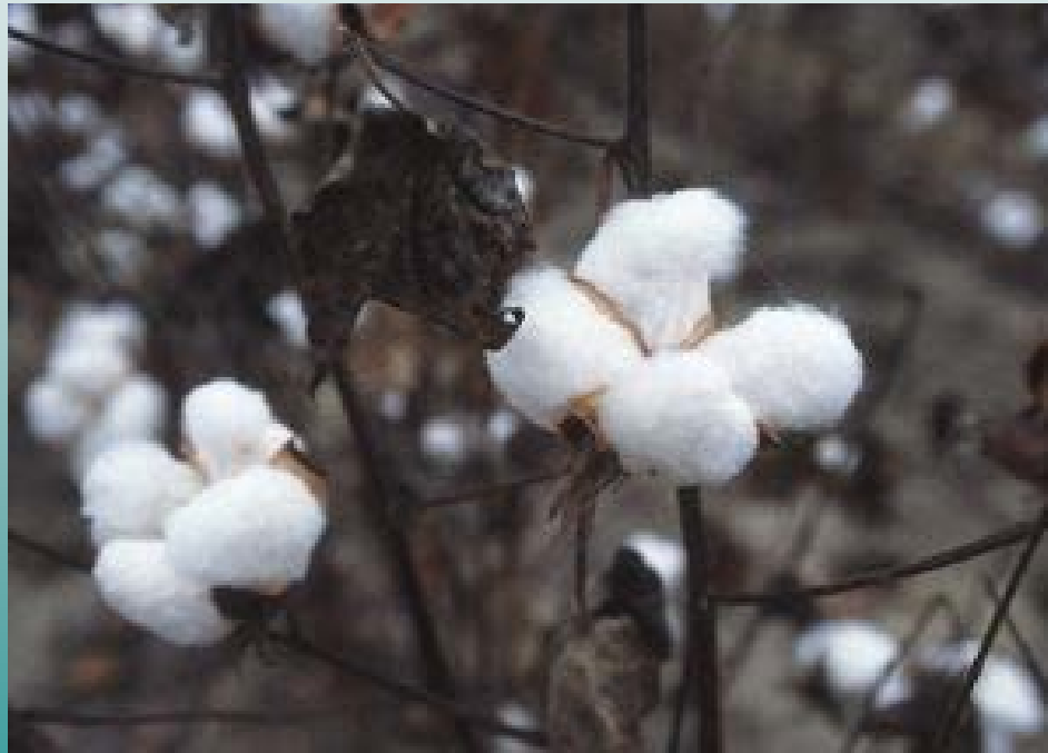
Cotton ready for harvest