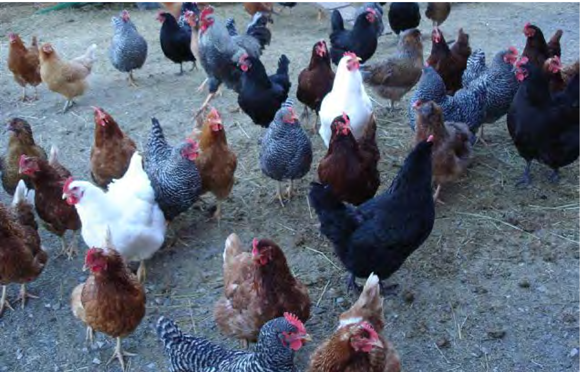
Flock of Chickens