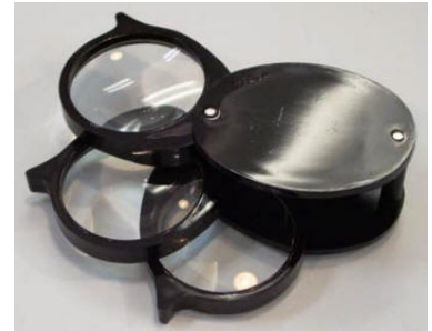
Figure 2. Hand lens

Use hand lens for seeing thrips. Use yellow or blue sticky traps to monitor thrips & winged adult thrips.