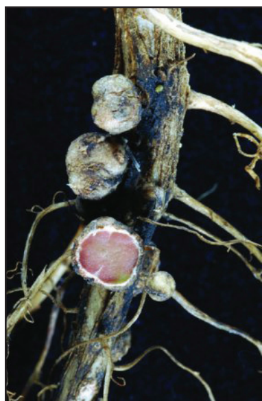
Figure 1.2. Nodules containing rhizobia on a soybean root. Active nodules when cut in half are red.

If a field is rotated out of soybean for an extended period of time (greater than three or more years), you should consider inoculating the soybean seed with rhizobia (Fig. 1.2). Rhizobia are soil bacteria that fix atmospheric nitrogen ( N_2 ). Nitrogen fixation has been found to be inhibited by the availability of a significant amount of soil inorganic N. Rhizobia bacteria are plant species specific. If soybeans are not seeded on a frequent basis, rhizobia bacteria populations will gradually decline. Sandy soils may require more frequent inoculations than fine-textured soils. In fields where soybeans have never been seeded or where soils have been flooded for extended periods of time, inoculation is a must.