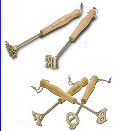
Hot Iron Branding