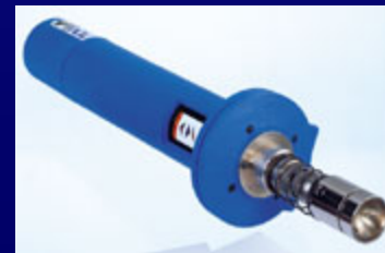
← Electric Dehorner