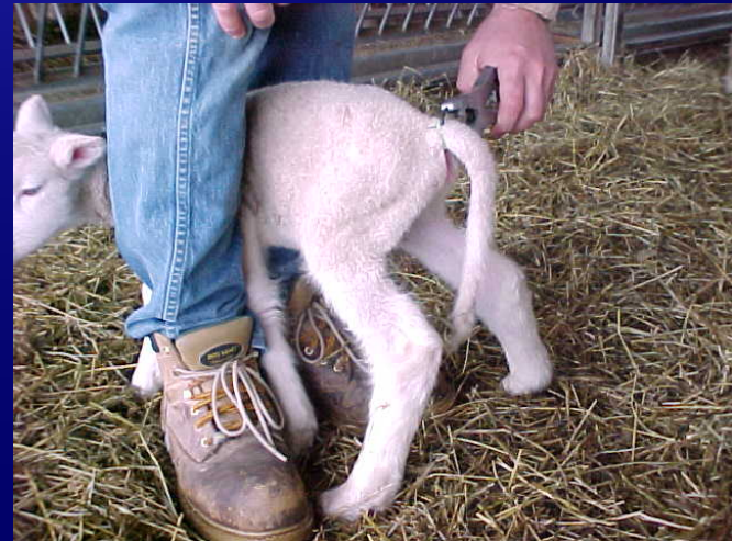
Docking a lamb's Tail using an elastrator