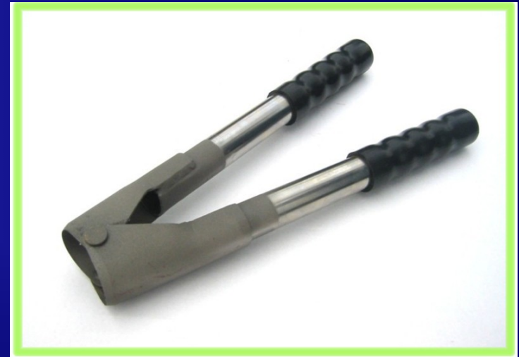
Manual Dehorner ↑