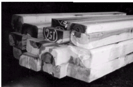
Hardwood flitches, or cants, before slicing into veneer stock