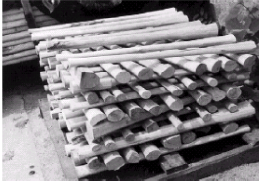
Air-seasoned hickory wood handle stock