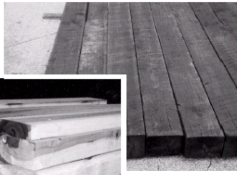
Pressure treated railroad cross-ties