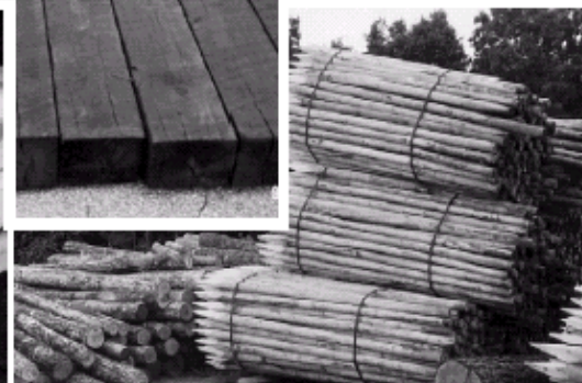
Fence posts ready for pressure treating with preservative