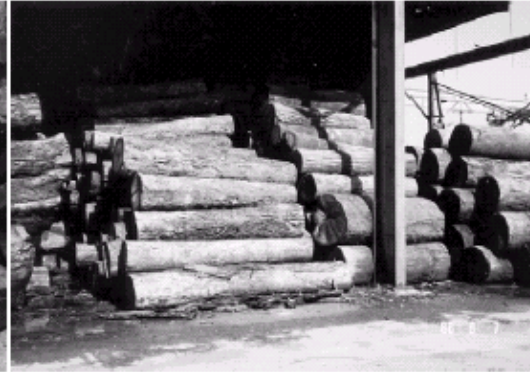
Hardwood veneer logs before veneer slicing operation