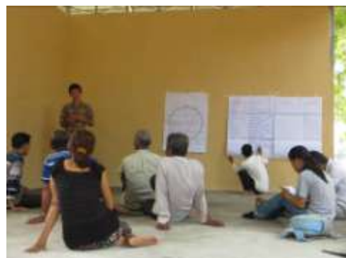
Notes are made on the posted sheets.

Use field visits to confirm problems identified during discussions.