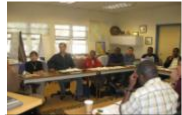
Improve adult learning by having clear learning objectives.

Copyright © UC Regents Davis campus, 2013. All Rights Reserved.